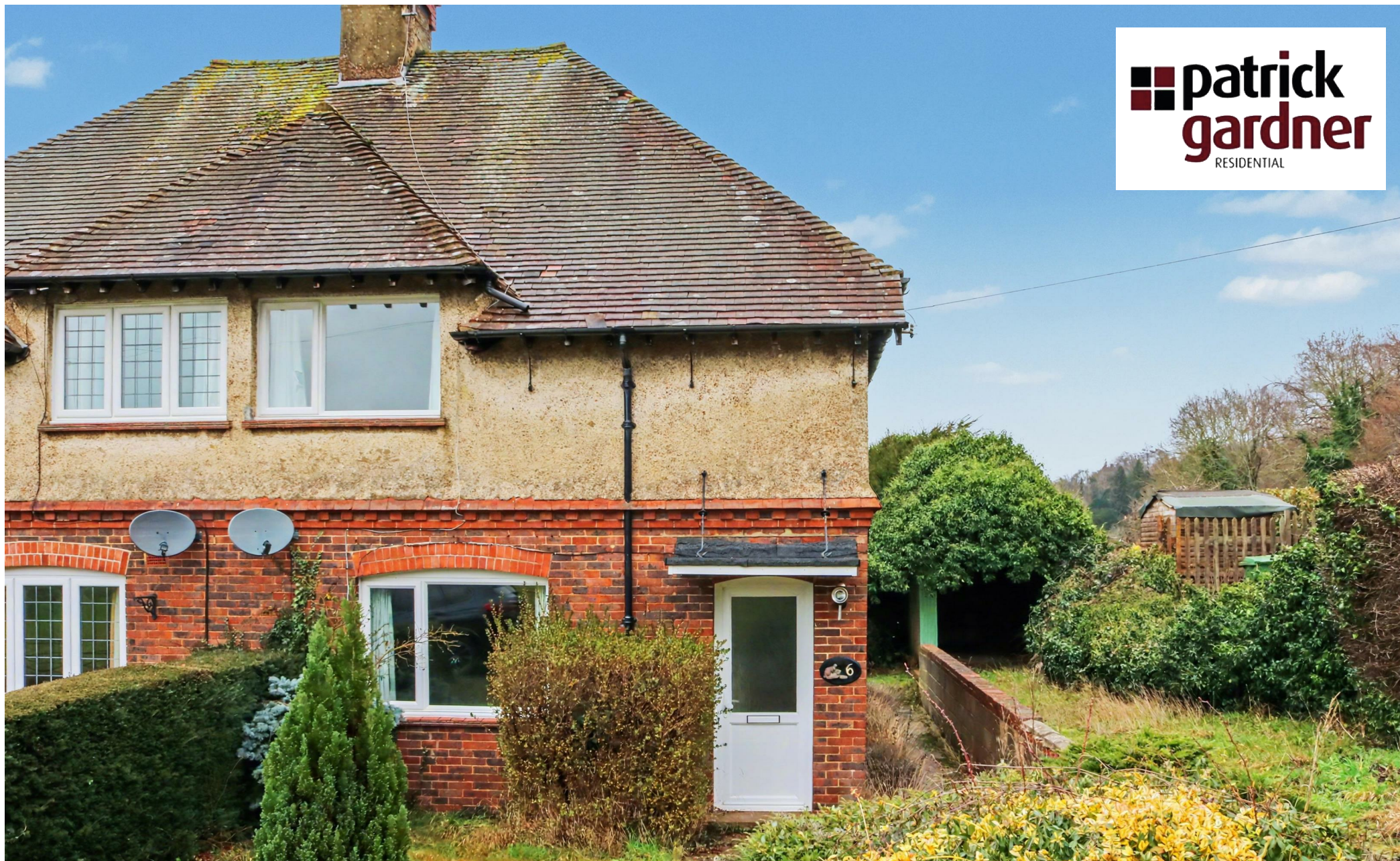
6 Dell Close Cottages Dell Close, Mickleham, Dorking, RH5 6EF